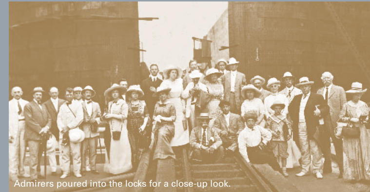
Admirers poured into the locks for a close-up look.