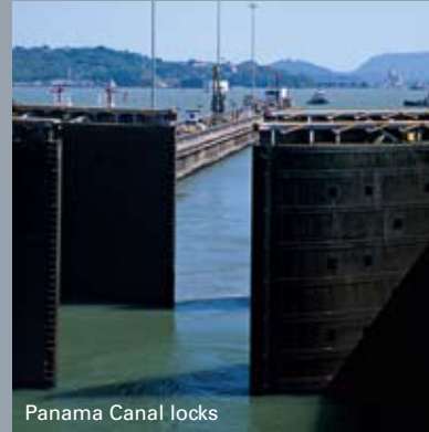
Panama Canal locks

While the Panama Canal was under construction, one early reporter wired, "This canal is both a first and a last . . . man will never again build with such scope, such imagination." Who knew that one day the Canal would be too small to handle today's maritime traffic and supersize ships? Solution: Dig another Big Ditch. Come witness history in the remaking as Panama expands and modernizes the Canal, all in time for its 100th anniversary in 2014.